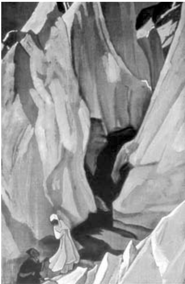
SHE WHO LEADS by Nicholas Roerich