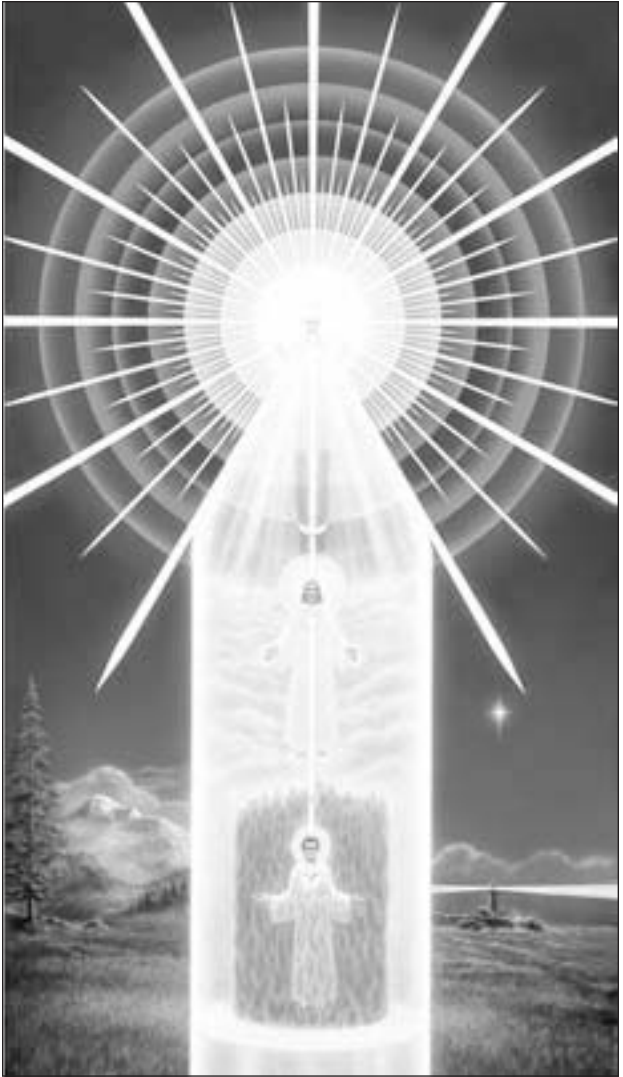
THE CHART OF YOUR DIVINE SELF